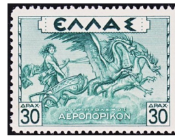
Triptolemus riding his Chariot