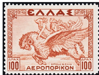
Phrixos and Helle