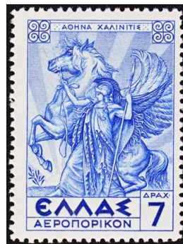
Athena, goddess of Wisdom and War