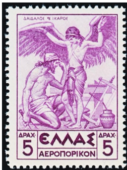
Daedalus and Ikaros