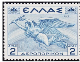
Iris, the messenger of the gods