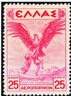
The abduction of Ganymede by Zeus