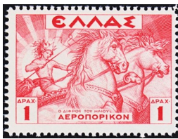
Helios and the Chariot of the Sun

This collection contains stamps that depict myths from Greek Mythology. The set of nine engraved stamps were issued by Greece in 1935. Since they are airmail stamps, each stamp design has a connection to aviation.