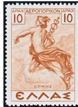
Hermes, the messenger of the gods