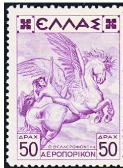
Bellerophon riding on Pegasus